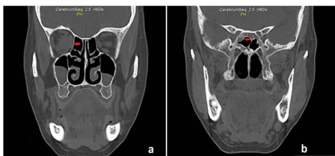
Figure 1: Paranasal computed tomography (CT) images. (a) Coronal CT demonstrating intraorbital tumoral lesion (arrow). (b) Coronal CT demonstrating tumoral lesion projected into right sphenoid sinus (arrow).