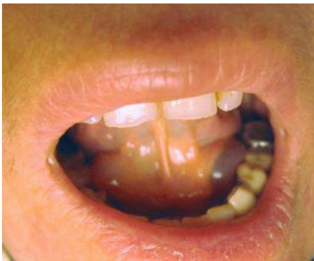
Figure 1. Intraoral view of the bilateral ranula

The differential diagnosis of ranula should include masses and swellings in the floor of the mouth and submandibular space region. These are dermoid and epidermoid cysts, branchial cleft cysts, thyroglossal duct cysts, cystic hygroma, lipomas, abscess, and malignant neoplasia 6,7,10 . Histologically, ranula consists of a central cystic space containing mucin and a pseudocyst wall composed of loose, vascularized connective tissues. Histiocytes predominate in the pseudocyst wall, but over time, these become less prominent. An important feature in the histologic diagnosis is the absence of epithelial tissues in the pseudocyst wall 8,11 .